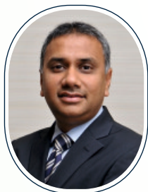
Mr. Salil Parekh CEO & MD, Infosys